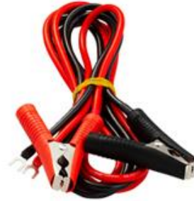
[ 6sq*2.0M*Pincers ]