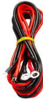
[ 10sq*2.7M ]